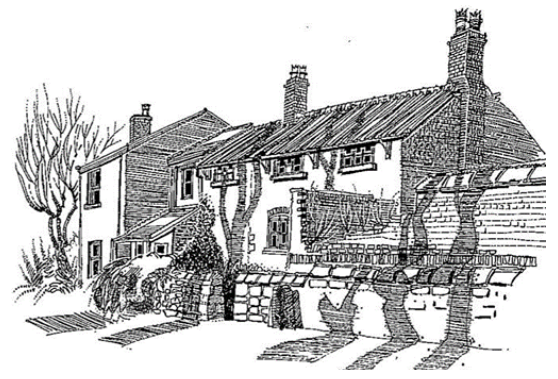
Drawing of a house inside Lunt Village Conservation Area