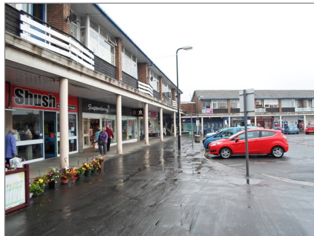
The Central Square Shopping Centre and car parking.

Vacancies within the centre represent 10.1% of units, slightly below the national average of 11.3% of units. In addition, the former Maghull Library building on Liverpool Road North is a prominent vacant unit, with the plot identified as for sale. A new library is now accommodated at the Meadows on Hall Lane, 0.5km to the south of the district centre. The former Stafford Moreton Youth Centre building on the neighbouring plot is also no longer in use. For consistency with previous health check surveys these two vacant buildings are not incorporated into the data provided in Table 1 as their previous use was not for commercial purposes. However, together these two neighbouring plots occupy a sizable area of presently underused land which is well connected to the primary activity of the district centre. The largest vacant unit within the centre is the former Red Lion Garage on Liverpool Road North at the northern extremity of the district centre.