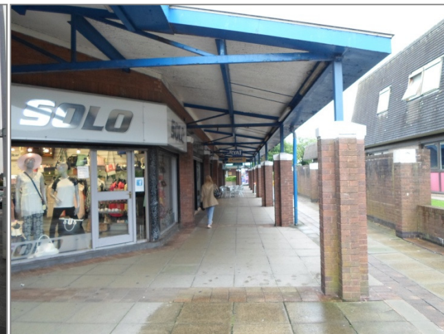
Pedestrian walkway alongside the Red Lion Centre.