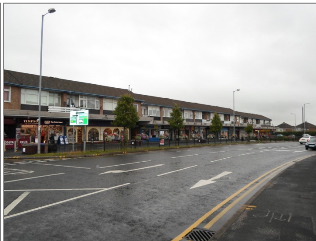
Shopping terrace, north side of Westway.