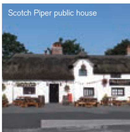
Scotch Piper public house

Returning to where the footpath meets the main road, cross over and into Hall Lane. After 0.75mile (1km) we reach