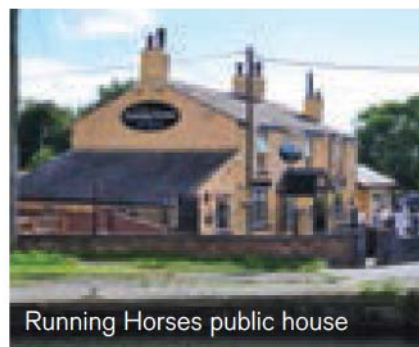
Running Horses public house